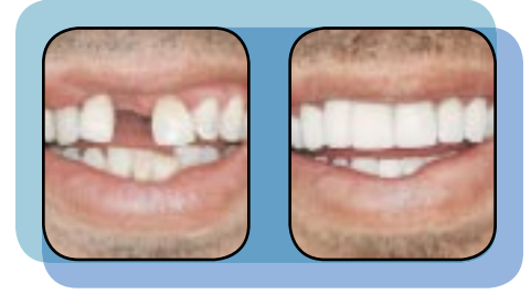
before & after an implant & veneers