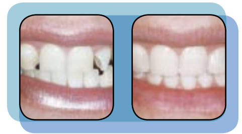
before & after bonding

Improve your world. Take the leap and call for a consultation.