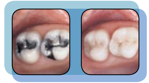
before & after composite fillings